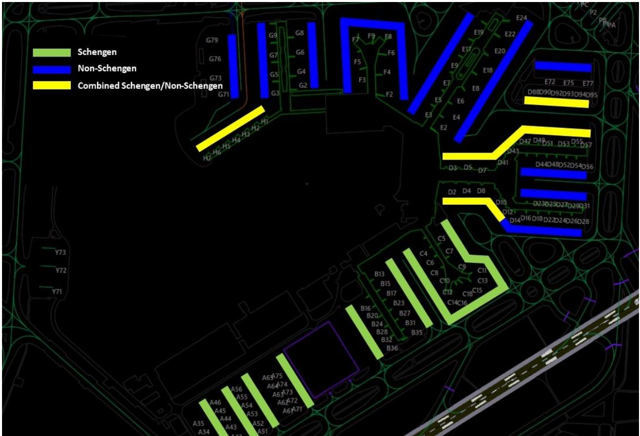
Figure 2. Schengen and non-Schengen gates overview at Schiphol.